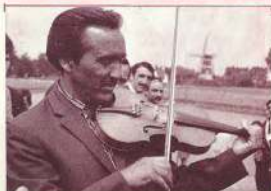
Christian Gypsy Musician in Holland

Everyone can co-operate in this effort. The smallest offering can become a powerful help when it is regularly sent. Who knows how long we will have the freedom to act in certain countries?