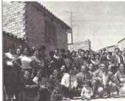
Gypsy Church in Spain