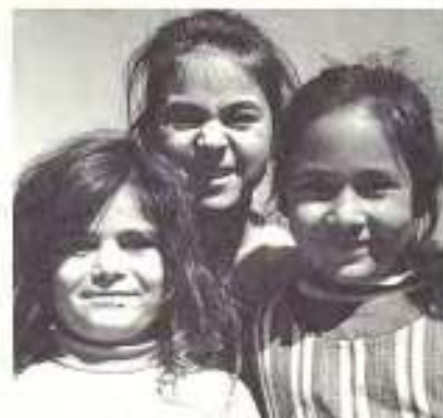
Gypsy Children in Texarkana, Texas

Yes! One Million Souls Who Need To Know Jesus Christ