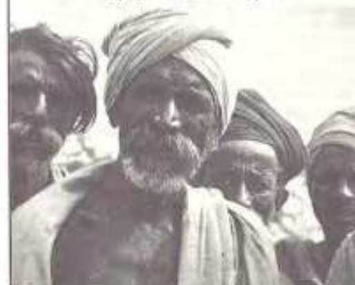
Gypsy Chiefs in South India 12 Reached by the Gospel