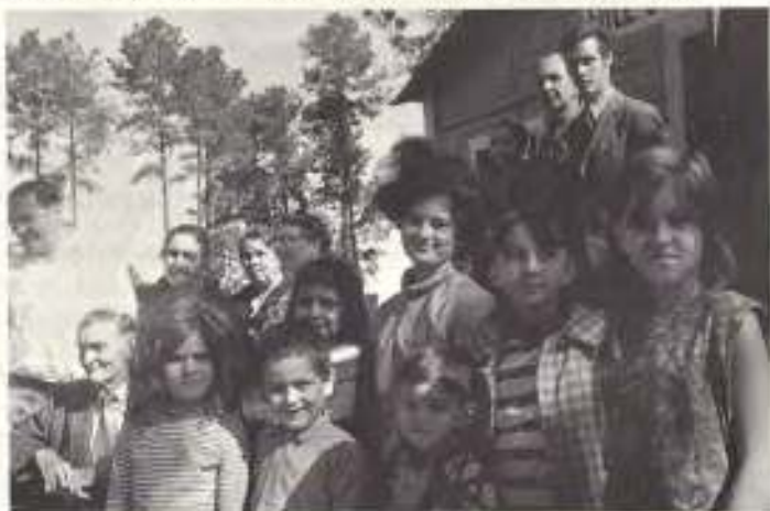
Some Members of the Gypsy Church in Texarkana