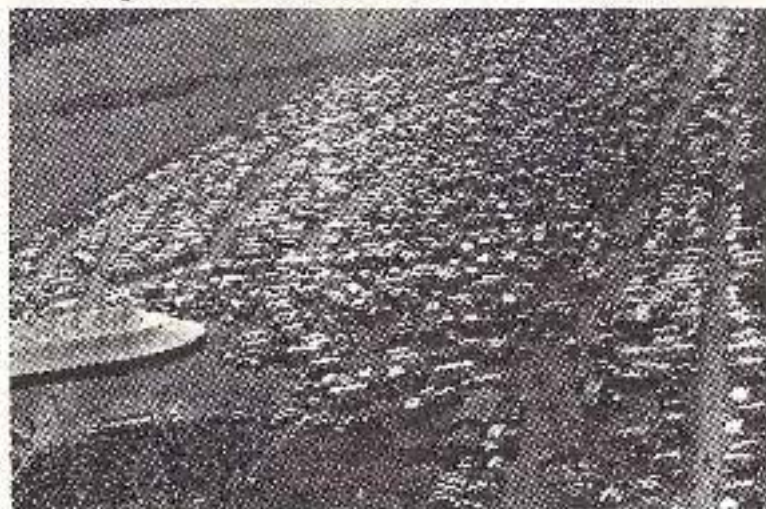
On left: The big canvas cathedral in which meetings are held four times a day.