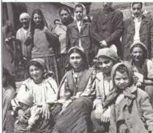
Gypsy Believers in Roumania